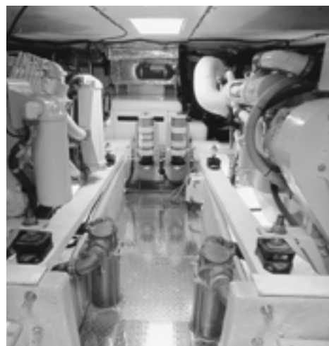
The 453's engine room with access through a door in the guest stateroom has plenty of room for maintenance, spare parts and tool storage.