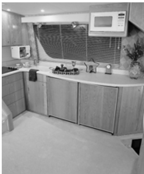
The 453's Pilothouse galley offers a great view and includes all the appliances and storage you could ever want.

From the flybridge, the Silverton 453 is one of the quietest boats of any size that I've ever run. At cruising speed, you hear the splash of waves against the hull, and a faint exhaust sound, but nothing more. On open water, away from shore, it's as if you're floating along in a dream. With all the comforts of home, you might be tempted to leave your land-based dwelling. What could be wrong with that?