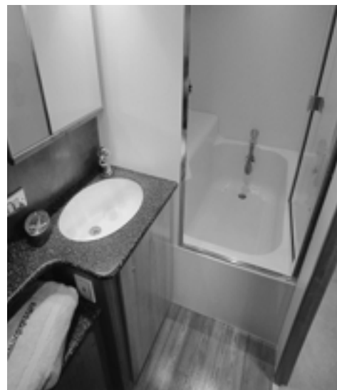
Master head with enclosed shower and bathtub.