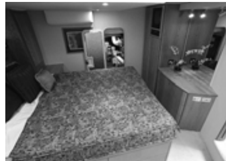
Like the master stateroom, the guest quarters also has a queen-sized berth, plus lots of closet space and a full head. You'll never have to invite your friends again; they'll call you.