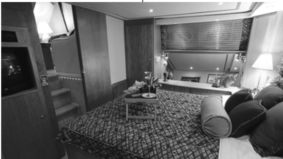
The master stateroom, with queen-size berth, is quiet, roomy and boasts oodles of closet space. It's not about a good night's rest, it's about a really good night's rest.

A 27-inch TV is the focal point of the main salon. It's standard, as is the VCR, five-disc CD player and AM/FM receiver. There is a pair of bar stools forward that turn the countertop into an eating or work space. To starboard, there's a couch that runs the length of the salon. Two sections of it open to become recliners, as does a chair aft to port. The area is done in soft fabric and wood tones—a comfortable place to be, either underway or in port.