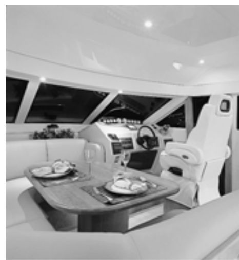
The inside helm station in the pilothouse version offers great visibility underway and a raised dinette can accommodate the whole crew.