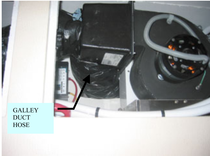
GALLEY DUCT HOSE